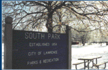
South Park at North Park Street & Massachusetts Established 1854