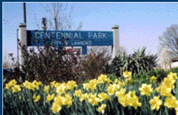
Centennial Park, 9th & Iowa Established 1954, 100th Anniversary