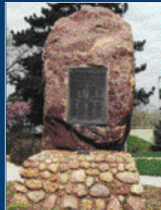
Founders Stone, 6th & Massachusetts Erected 1929, 75th Anniversary