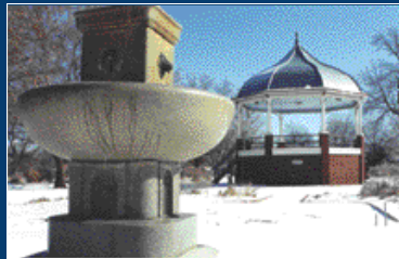
Horse Fountain & Gazebo, South Park Fountain dedicated in 1910 by Teddy Roosevelt